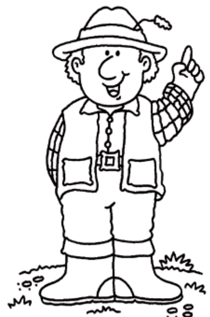
Illustration © Jenny Tulip