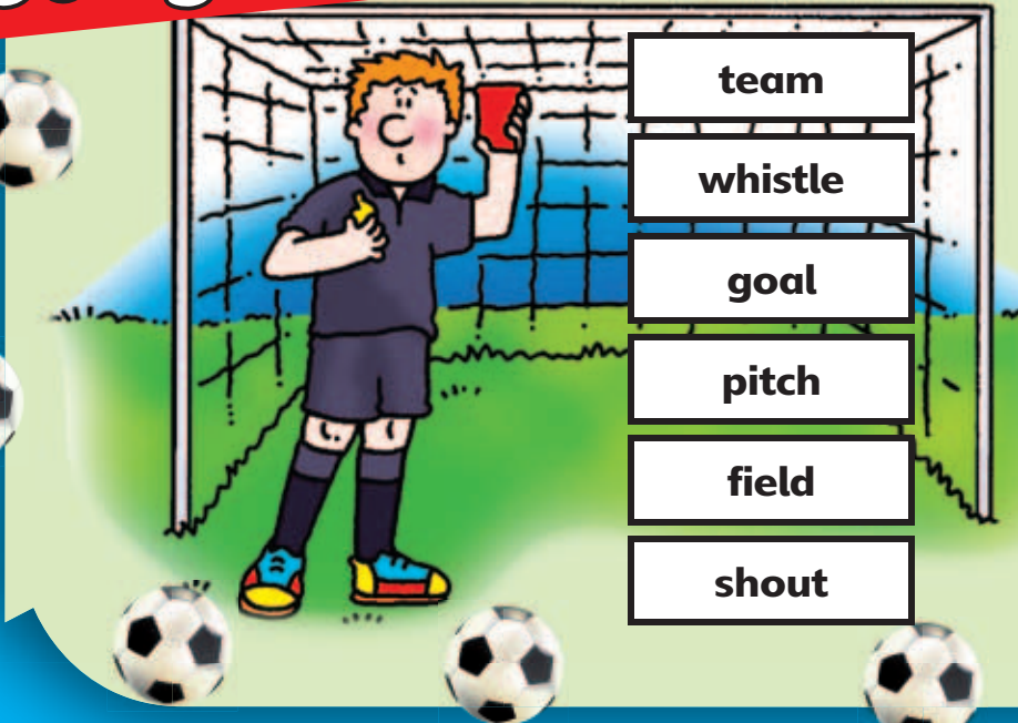
Illustration © Jenny Tulip